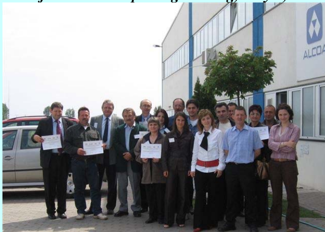
Figure 5: Project team at reporting meeting, May 3, 2007